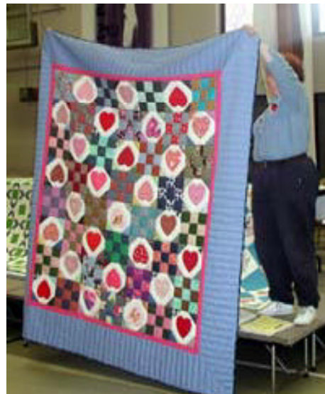
A heart quilt...ideal for entry in the 2003 show, "Deep In The Heart....."